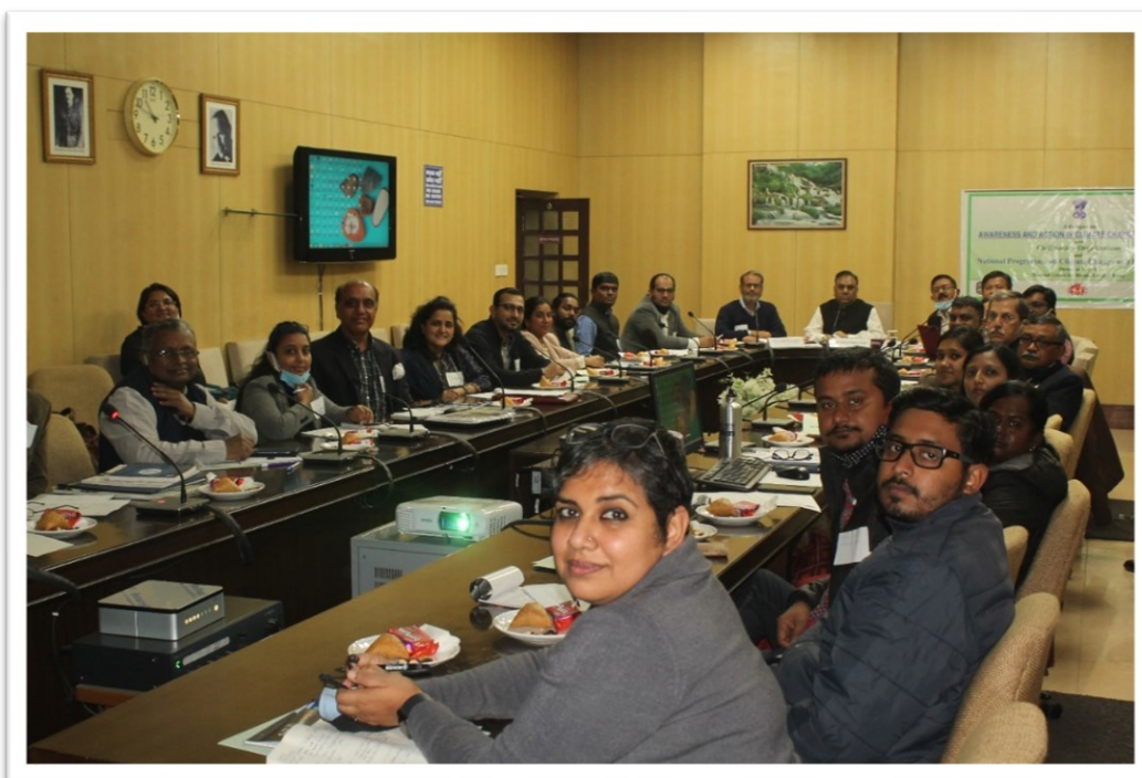
Director, NCDC chairing the meeting with more than 30 Civil Society Organization representatives with officers from National Programme on Climate Change and Human Health (NPCCHH) on December 1, 2021 at NCDC, Delhi