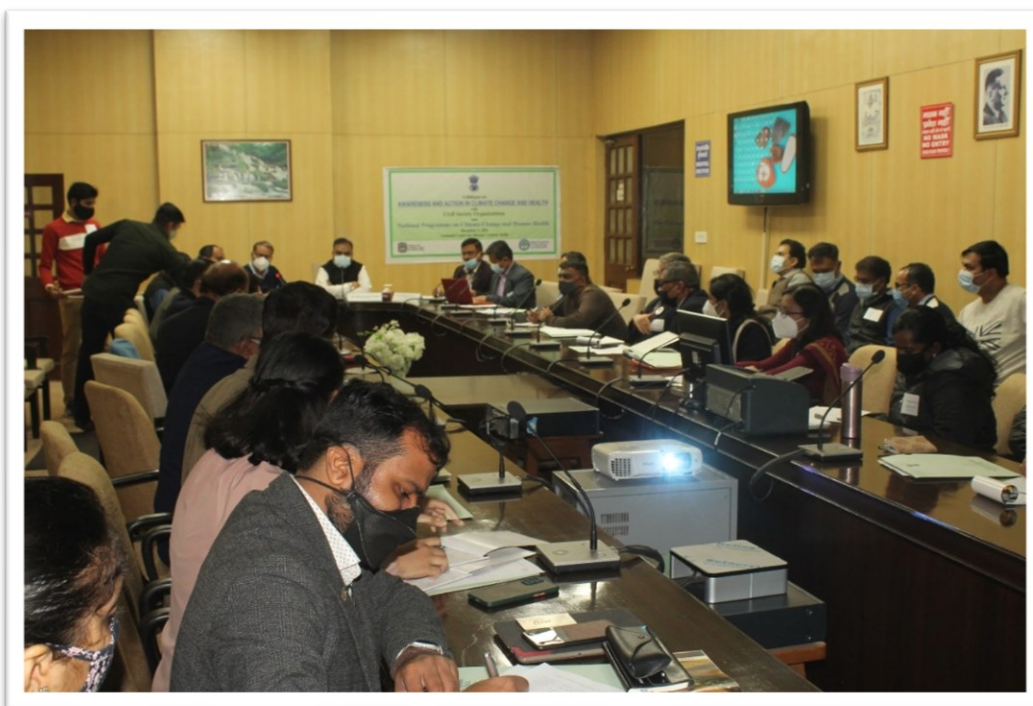
Deliberations of the Civil Society Organization meeting with NPCCHH, on December 1, 2021 at NCDC, Delhi