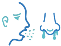
Inhaled Droplets from Coughing & Sneezing