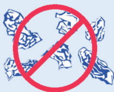
Avoid reuse of tissues