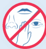
Avoid Touching your Eyes Nose or Mouth