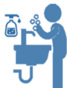
Wash Your Hands regularly With Soap & Water