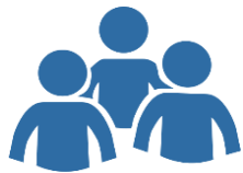
Person to Person