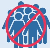
Avoid Crowded Places