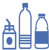
Drink plenty of Fluids