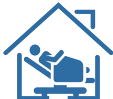
Isolation of Cases