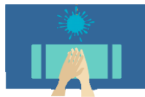
Droplets on Hands & Surface