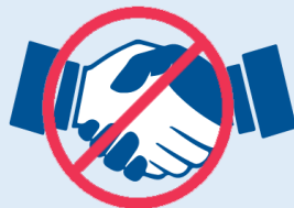
Avoid Shaking Hands